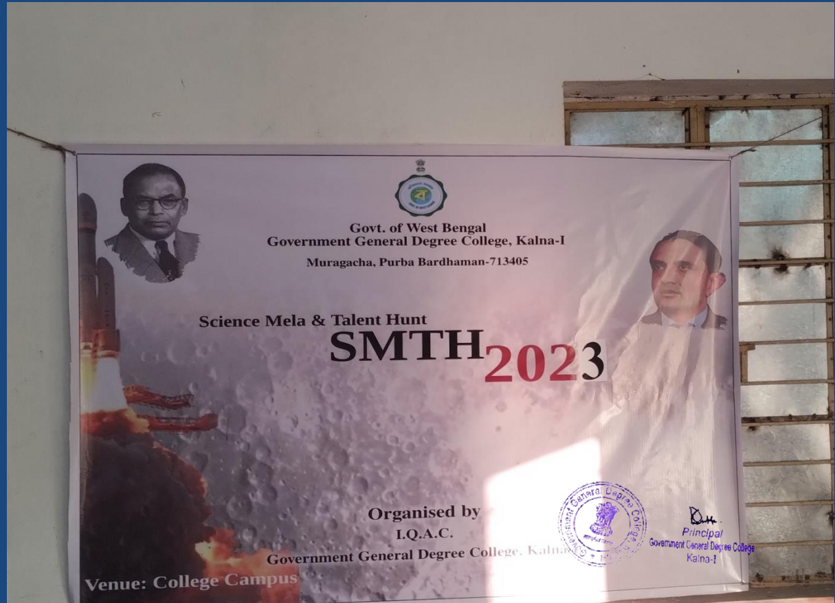
Brochure & Flyer. SMTH 2023 GGDC Kalna-I