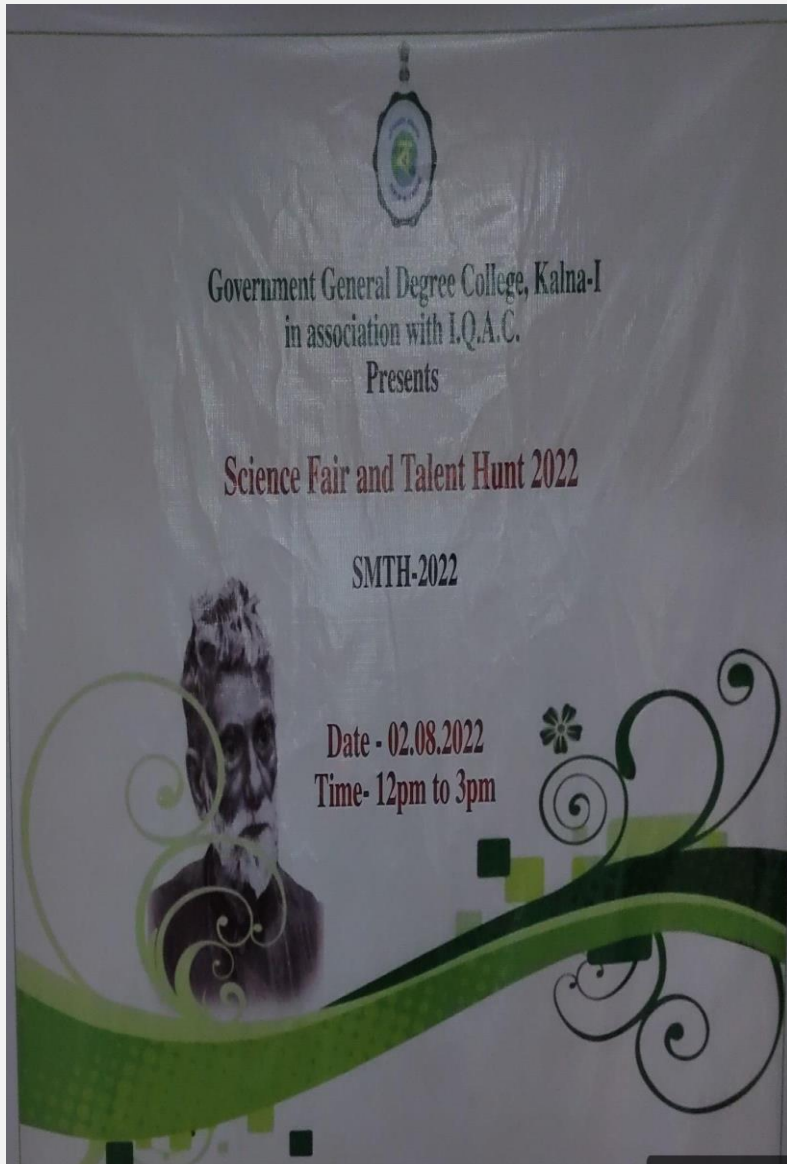
Flyer. And Photo SMTH 2022. GGDC Kalna-I