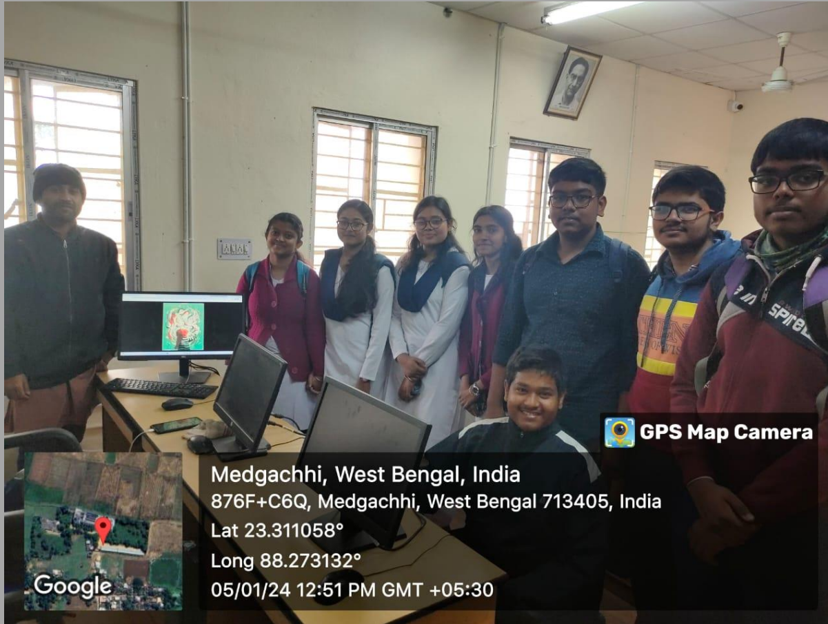
Students of Simlon A. K. Vidyamandir with others