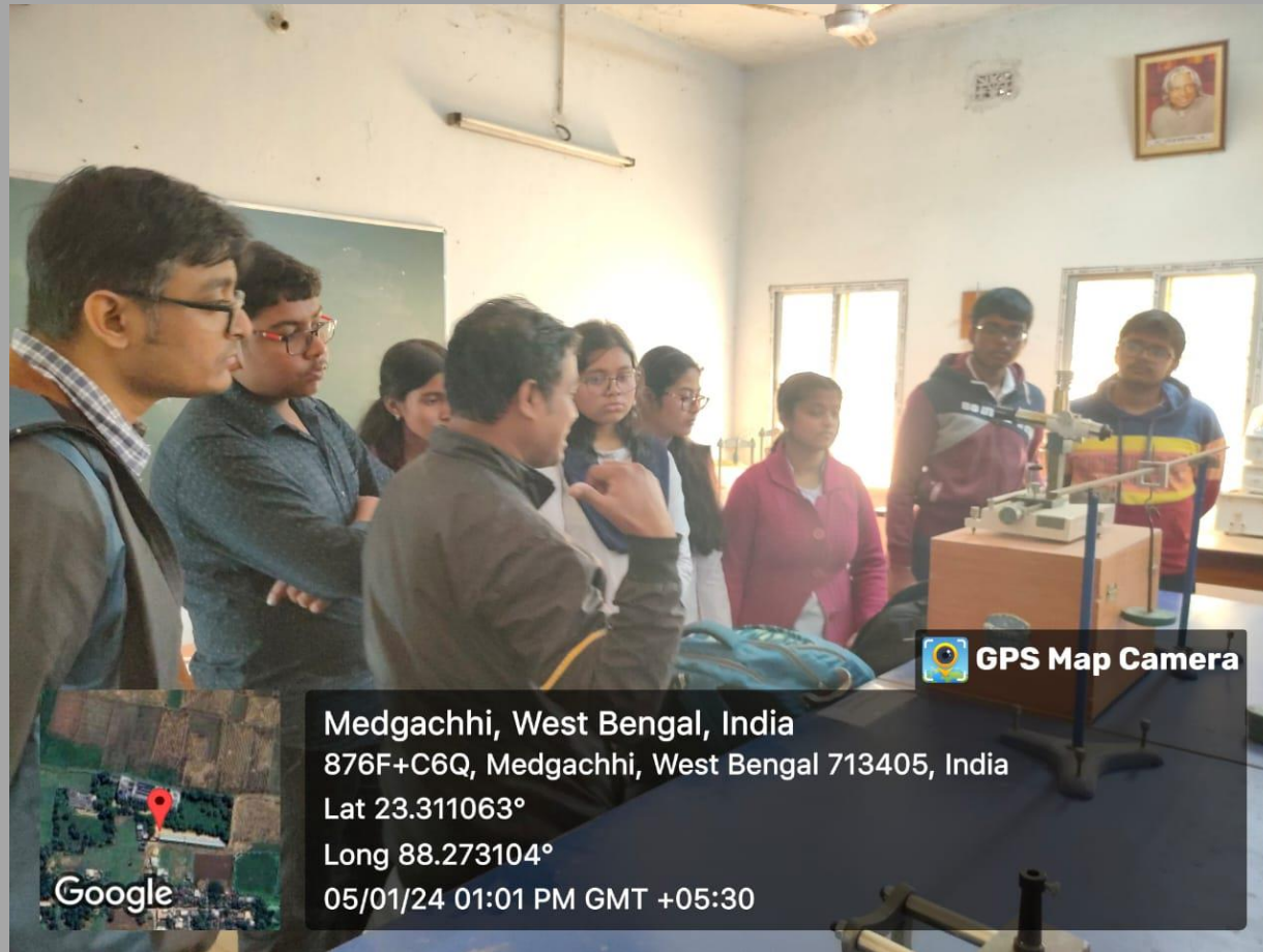
Students of Simlon A. K. Vidyamandir with others