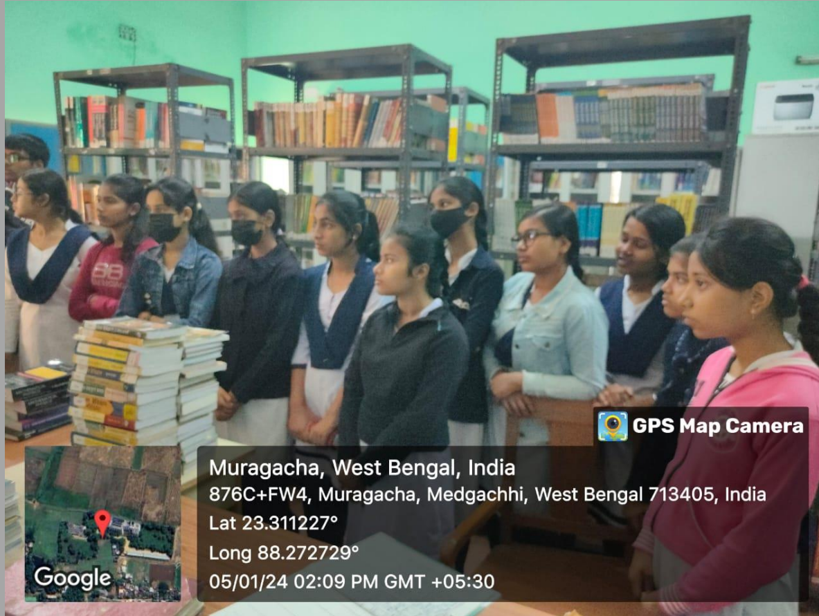
Students of Simlon A. K. Vidyamandir with others